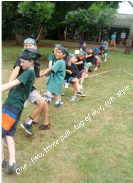
One, two, three pull...tug of war, cub style

After lunch the Cubs attended different bases, Slip and slide, Pirates commando course, which included walking the plank, Captain Hooks relay, and ran the gauntlet (being hit with wet sponges). For handcraft they made Pirate finger puppets, made a hook, and a scar for their face. At the end they all went for a treasure hunt around the camp. All the Cubs got changed into uniform and attended a short Service to remember the founder of the Scout Movement Lord Robert Baden Powel, with the parents.